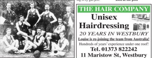
Pictured above: Westbury water polo team, 1989

department on the other. The chief feature of the internal arrangements is of course the swimming bath. In addition to this bath, which is 68 feet long by 23 feet wide, there are two first class and four second class, private slipper baths for men and four for women, with waiting rooms, etc., all of which are also fitted with gas lighting in the evenings. "An unlimited supply of hot and cold water is available, the arrangements in this respect being most complete. The heating of the corridor and waiting rooms is by hot water, and the building contains all necessary accommodation, including laundry and drying chamber and several rooms for the use of the superintendant." "Electric bells are fitted throughout, and the lighting is by gas jets."