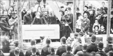
Above: the commemorative stone is installed